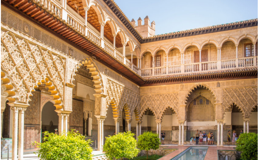
Alcázar of Seville – One of the patios

Here are the best things to do in Seville on your second day: