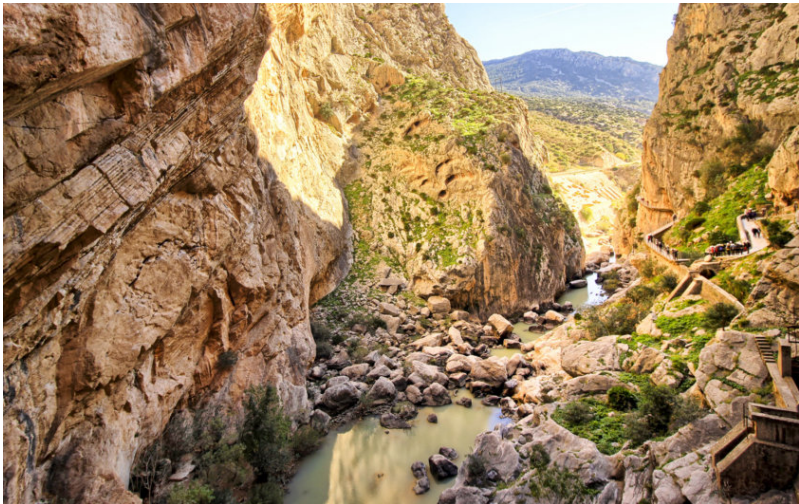
Caminito del Rey Path

3. The last option is to enjoy the beach a bit more during these 9 or 10 days in Andalucia. Take your car and drive to Marbella , 1 hour driving away. This trendy coastal resort on the Costa del Sol offers 20km of beaches to relax and enjoy the sun.