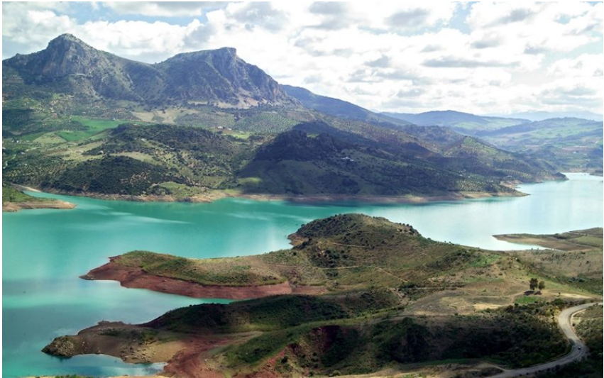
Grazalema Natural Park