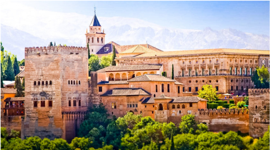
Alhambra Palace: The most visited monument in Spain