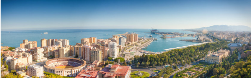
Malaga's Bay from the Viewpoint of Gibralfaro