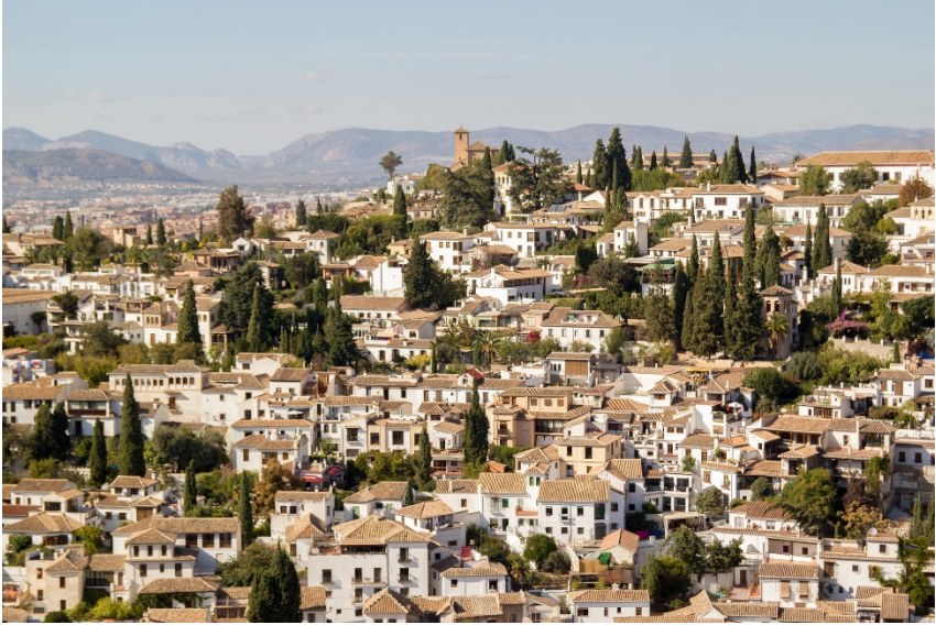
The Albaicin Neighbourhood: Unesco World Heritage

As going to Granada will take you about 2h20, it's best to leave quite early in the day.