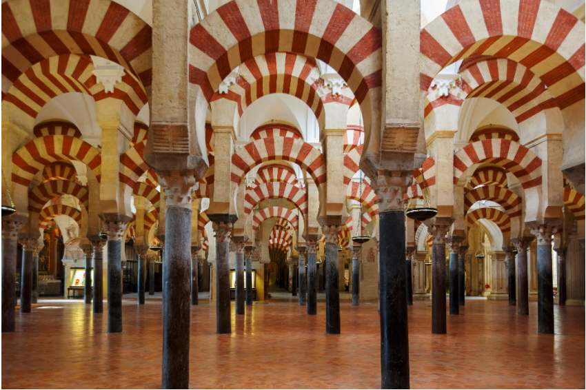
Great Mosque of Cordoba

For the second part of this 9-10 days tour in Andalucia, let's take your car and go to Cordoba (1h40 drive from Seville).