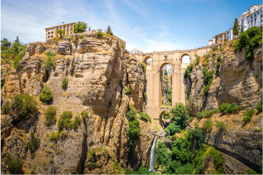
Ronda and its “Old Bridge”