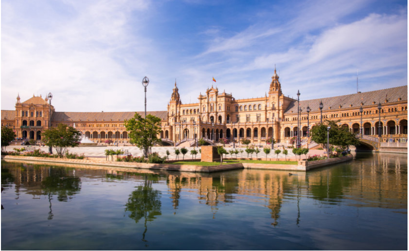
The magnificent Plaza de España, in Seville